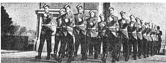
THE REGULAR OFFICER TRAINING PLAN—This is a tri-Service Plan wherein high school graduates receive advanced education and leadership training at one of the Canadian Service Colleges or a university to become officers in the Royal Canadian Navy, the Canadian Army or the Royal Canadian Air Force.