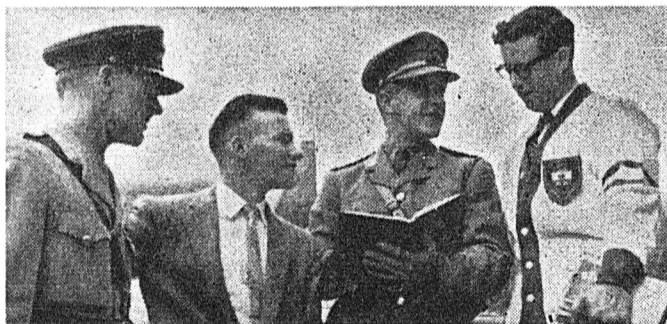
THE CANADIAN OFFICERS' TRAINING CORPS—University undergraduates may obtain a commission by training during their spare time and summer holidays. The student who trains under this plan is paid for his actual training time and is not obligated for full-time service after graduation.