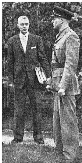
THE OFFICER CANDIDATE PROGRAMME—Selected high school graduates, not wishing to undergo academic training for a degree, may qualify as a short service officer after a brief intensive period of military training and later may apply to become a regular officer.

You may obtain full information on any of these plans from your University Army Resident Staff Officer.