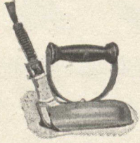
3-pound Flat Iron for Sewing Room or Nursery

The heating and cooking appliances designed and manufactured by the Canadian General Electric Company mark a new epoch in domestic science in that they employ electricity to generate heat with absolute reliability and (when properly used) with excellent economy. They are SAFE even in the hands of the unskillful, and are practically INDESTRUCTIBLE.