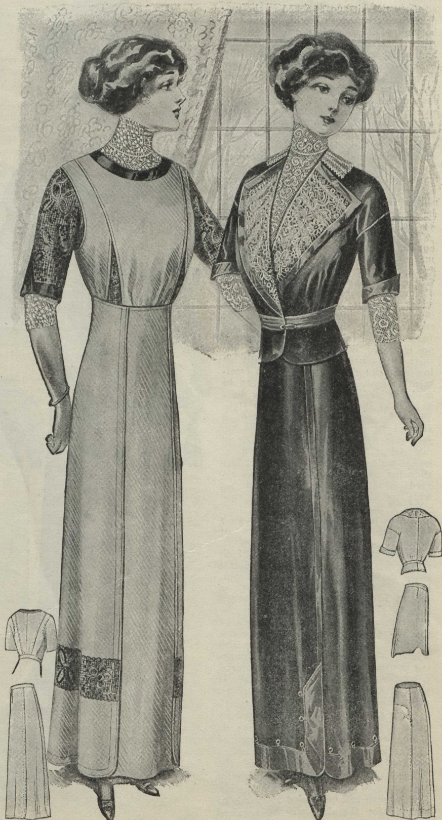
Blouse Pattern No. 7234 Skirt Pattern No. 7238

EVERY possible kind of tunic is fashionable this winter, the long and the short, the straight and the shaped. Illustrated are two gowns that