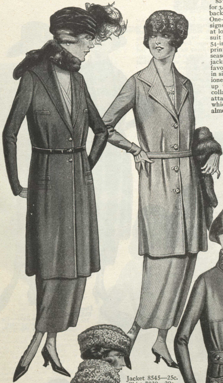
Jacket 8578—25c. Skirt 8416—20c.

8578—Ladies' Jacket. Designed for 34 to 46 bust. Length at center-back 45 inches. No. 8416—Ladies' One-piece Gathered Skirt. Designed for 24 to 36 waist. Width at lower edge about 1 3/8 yard. The suit in medium size requires 4 yards 54-inch serge—3 3/8 yards 36-inch printed taffeta for lining. As the season advances the suit with long jacket seems to be increasing in favor. Here is an attractive model in simple tailored style to be fashioned of serge or tricotine and made up without trimming. A square collar finishes the neck and is attached to the fronts of the jacket which roll to form revers opening almost to the waist-line.