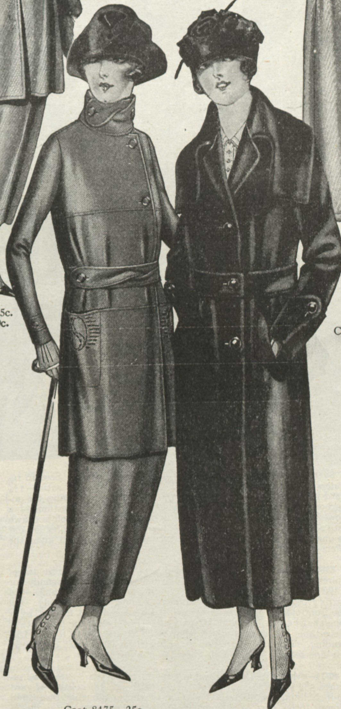
Coat 8475—25c. Embroidery 1237, blue or yellow—20c. Skirt 7905—20c.