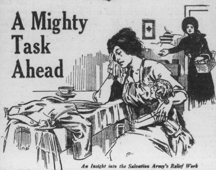
An Insight into the Salvation Army's Relief Work amongst Soldiers' Families.

A PPROXIMATELY 300,000 Canadian soldiers will arrive home within the next twelve months. Home! To some that word means joyful compensation for all they have gone through. To others, home will mean simply hardships in a new form—struggles to keep a roof overhead; to find a job; leaving a sick wife in bed, children unattended, while the daily bread is earned!