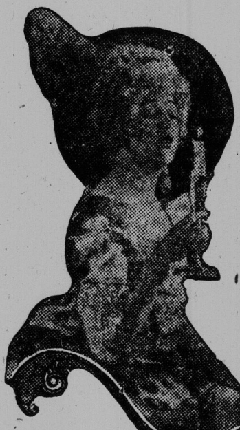
Mabel Normand in Mack Sennett's "Molly O."