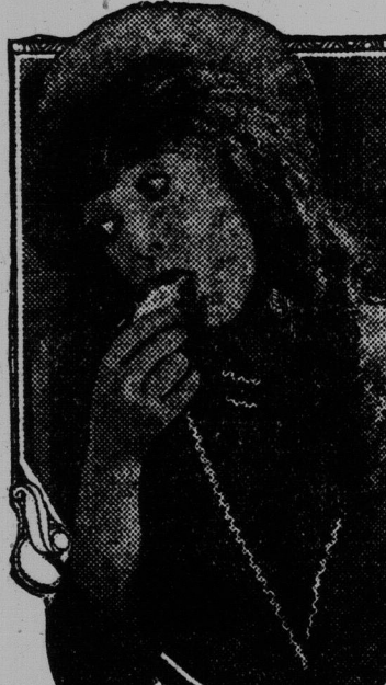
Mabel Normand in Mack Sennett's "Molly O."

Enough of Everything In It To Please Everybody. You've Heard The Song, You've Eaten the Biscuits—Now See Molly Herself