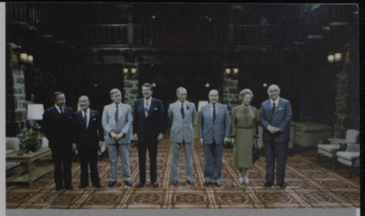
1981: Leaders at the Montebello G-7 Summit

1960 External Aid Office (now CIDA) established