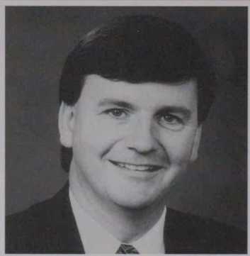
Secretary of State (Central and Eastern Europe and Middle East) Gar Knutson