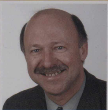
Secretary of State (Latin America and Africa) (Francophonie) Denis Paradis

T he major Cabinet shuffle of January 15, 2002, has brought new ministers and secretaries of state to the team directing Canadian foreign policy. International Trade Minister Pierre Pettigrew keeps his portfolio and Secretary of State David Kilgour assumes new duties within the Department of Foreign Affairs and International Trade. Here are the new members of the team.