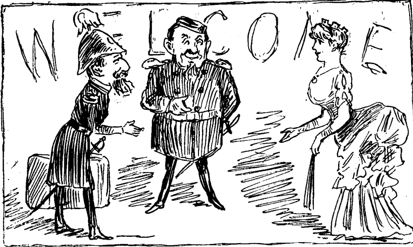
MISS TORONTO MAKES AN IMPRESSION.

Visiting K. of P.—WELL, MISS, I'D HEARD TELL OF YOU ; BUT I HAD NO IDEA YOU WERE HALF SO SCRUMPTIOUS !