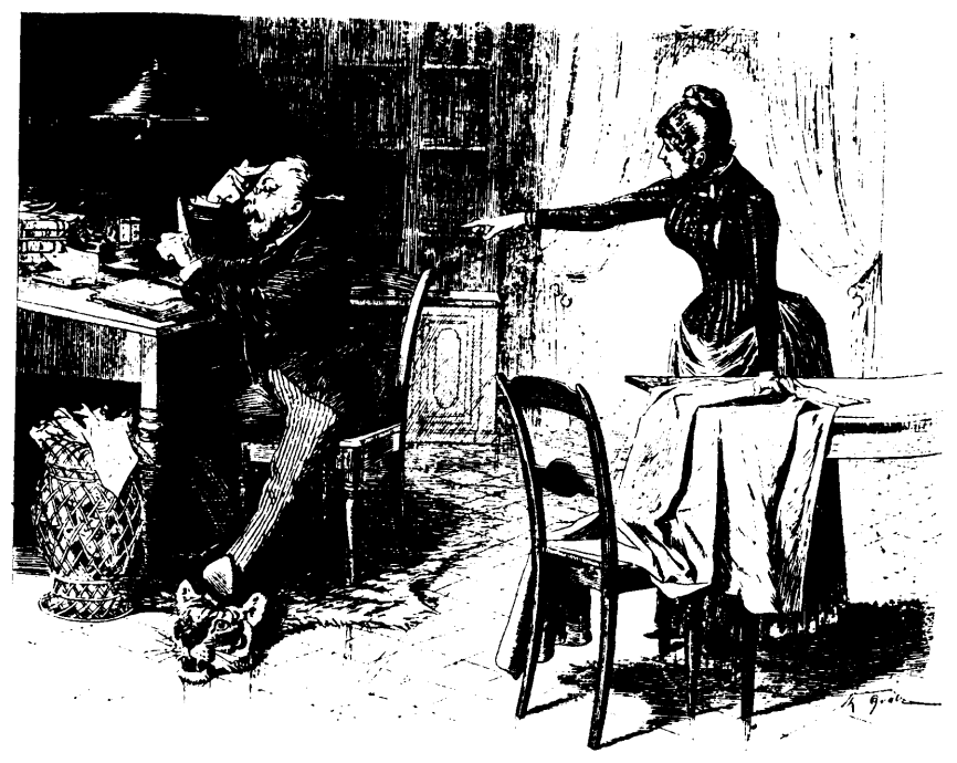
THE PROBLEM SOLVED.

"Certainly, these must be the celebrated flesh pots of Egypt!"