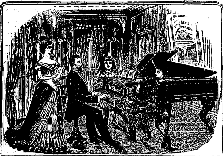
THE WEBER BABY GRAND. RECEIVED HOME.