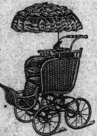
RECLINING FOLDING GO-CART

No. K. 58, U. & P.—Body is reed, varnished, sides upholstered, has mattress cushion, lace par-asol. Gear is all steel, four 12in rubber tire wheels, patent wheel fastener, foot brake, patent telding cross reach. Dark green enamel finish. Enameled push bar. Price .....$18.00