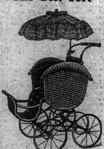
RECLINING FOLDING GO-CART No. K. 55, U. & P.—Body is reed, varnished, sides upholstered, has mattress cushion, lace parasol. Gear is all steel, four 12-in. rubber tire wheels, patent wheel fastener, foot brake. Patent folding cross reach. Dark green enamel finish. Enameled push bar. Price.....$15.00

FOLDING GO-CART No. K. 31.—Body is steel and hardwood, varnished. Gear is all steel; four 10-in. rubber tire wheels, patent wheel fastener. Dark green enamel