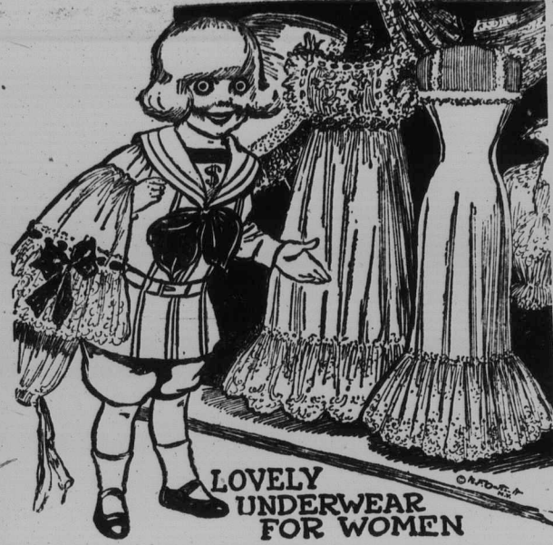
LOVELY UNDERWEAR FOR WOMEN