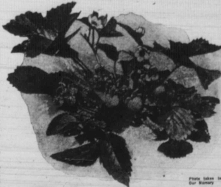
Photo taken in Our Nursery

The Greatest Acquisition yet introduced into the West to provide Fresh Fruit Constantly.