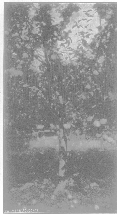
SEVEN YEAR OLD BLUSHED CALVILLE APPLE TREE IN BEARING IN MANITOBA.

With a view to ascertaining just what are the keeping qualities of apples grown in the prairie province a letter