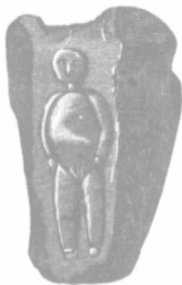
FIG. 109. (Full Size).