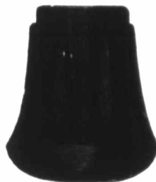
Rubber Chair or Crutch Tips.

Made in rolls one yard wide and any length. Thickness and weight about as follows to the square yard: 3-32-inch, 7½ pounds.