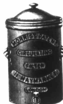
The Morris Patent "Circulating" Filter. As supplied to Her Majesty's Army and Navy, Cream Enamelled Stoneware, Complete with Patent Stoneware or Metal Tap, and charged with Carbon, ready for use.