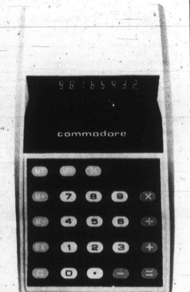
Commodore 887D — full memory, ideal for the student or salesman.

These days you can buy a calculator almost anywhere and it'll come complete with a manufacturer's warranty. This means that if anything goes wrong with it during the warranty period, you return it to the store and in most cases the store returns it to the manufacturer. This procedure could leave you without a calculator for weeks, maybe a month, or more. The calculator you buy at Willson is covered by the same manufacturer's warranty. However, we have also added our own 90-day, "over-the-counter" guarantee. If your calculator proves faulty because of defective materials or workmanship during the first 90 days after purchase, we'll provide you with a replacement instantly. On-the-spot. Our guarantee is one good reason why you should buy your calculator from Willson. There are others. At Willson we demonstrate. You're welcome to try the calculators for yourself at our special calculator bar. At Willson we know calculators. They're an important part of our business. We'll help you select the right one for your needs.