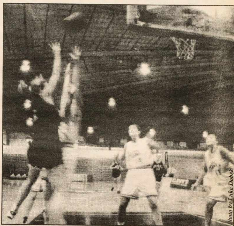
Action from the two-game series against Memorial this weekend. Dal won both games.