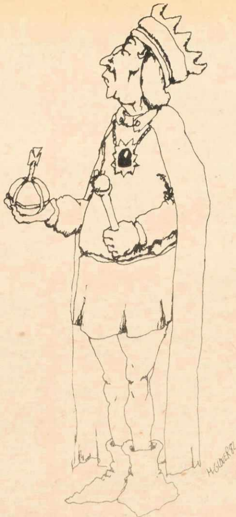
This year's Winter Carnival will be complete with Dalhousie royalty

Running concurrent with carnival this year are "Super Societies" events. For the first time, Winter Carnival will have a business man-