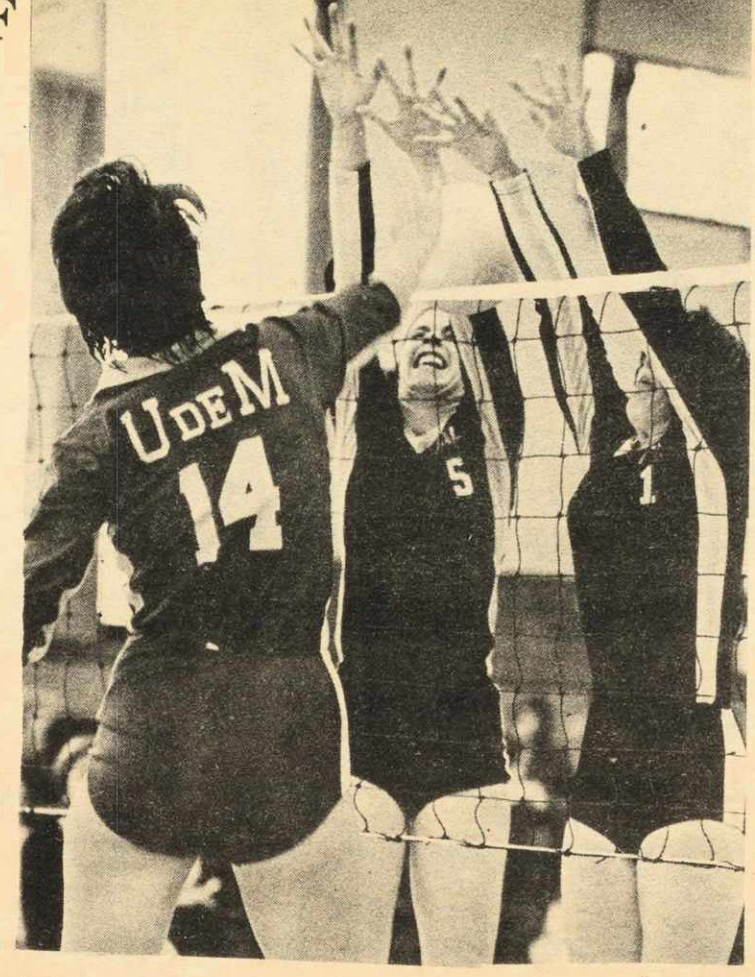
A Université de Moncton spike gets between a Dal block set up

For Sale: 3/4 length Mouton fur coat, very warm, excellent condition, Size 18. $20. Phone