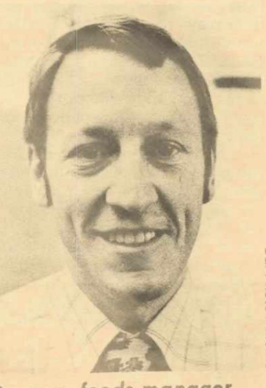
Beaver foods manager

Condolences, not congratulations, are in order. Yes, you will see me move (from the cafeteria to the nearest can) (weak stomach). As for the donuts, Beaver is not capable of making them themselves and therefore have to buy them