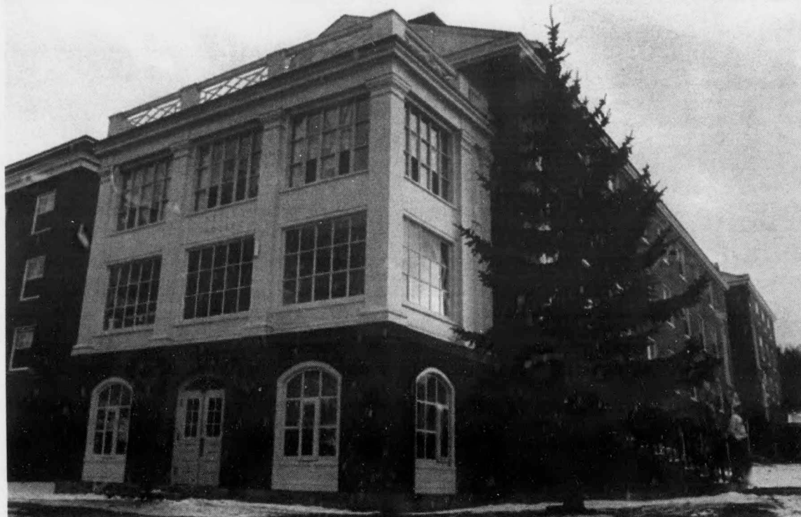
Things are far from over at Neill House