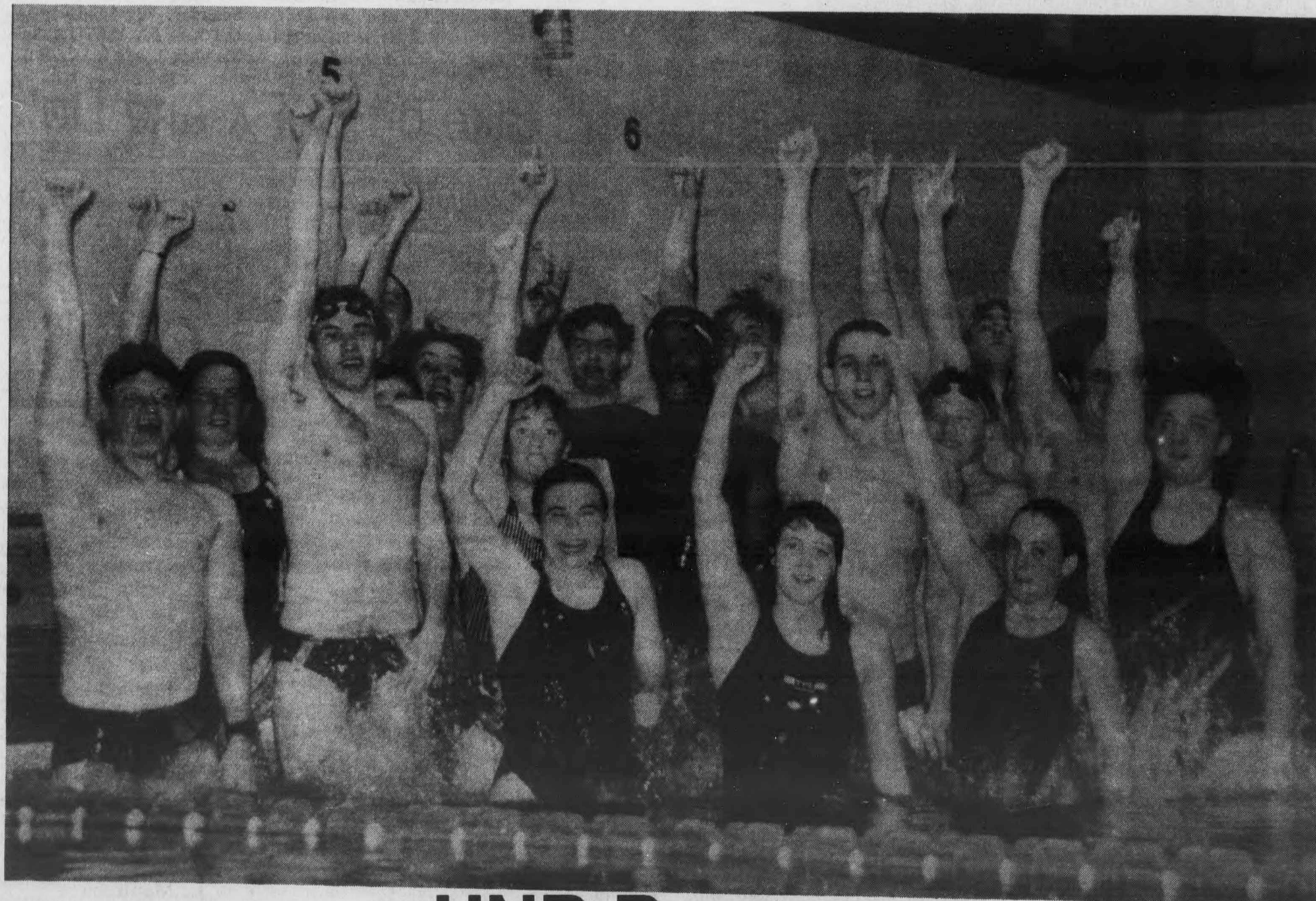
UNB Beavers Catch the Excitement