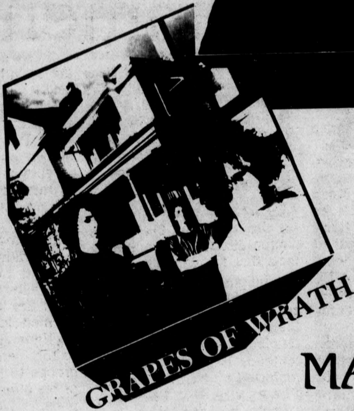
GRAPES OF WRATH