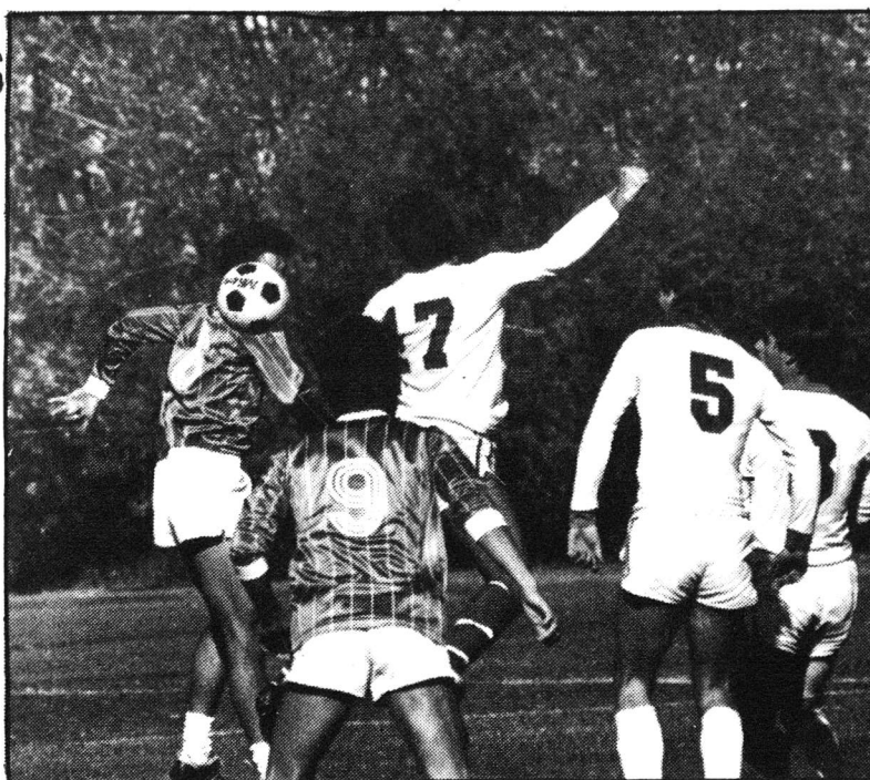
This coastal swing to UBC and UVic could decide the Bear's fate.