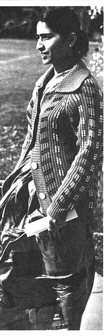
QUE SARI, SARI

If we examine the subject any closer we may only begin to notice all the gaping seams, missing buttons, run nylons, and unzipped zippers to be found upon close scrutiny of every group, no matter what dress they affect—or don't affect.