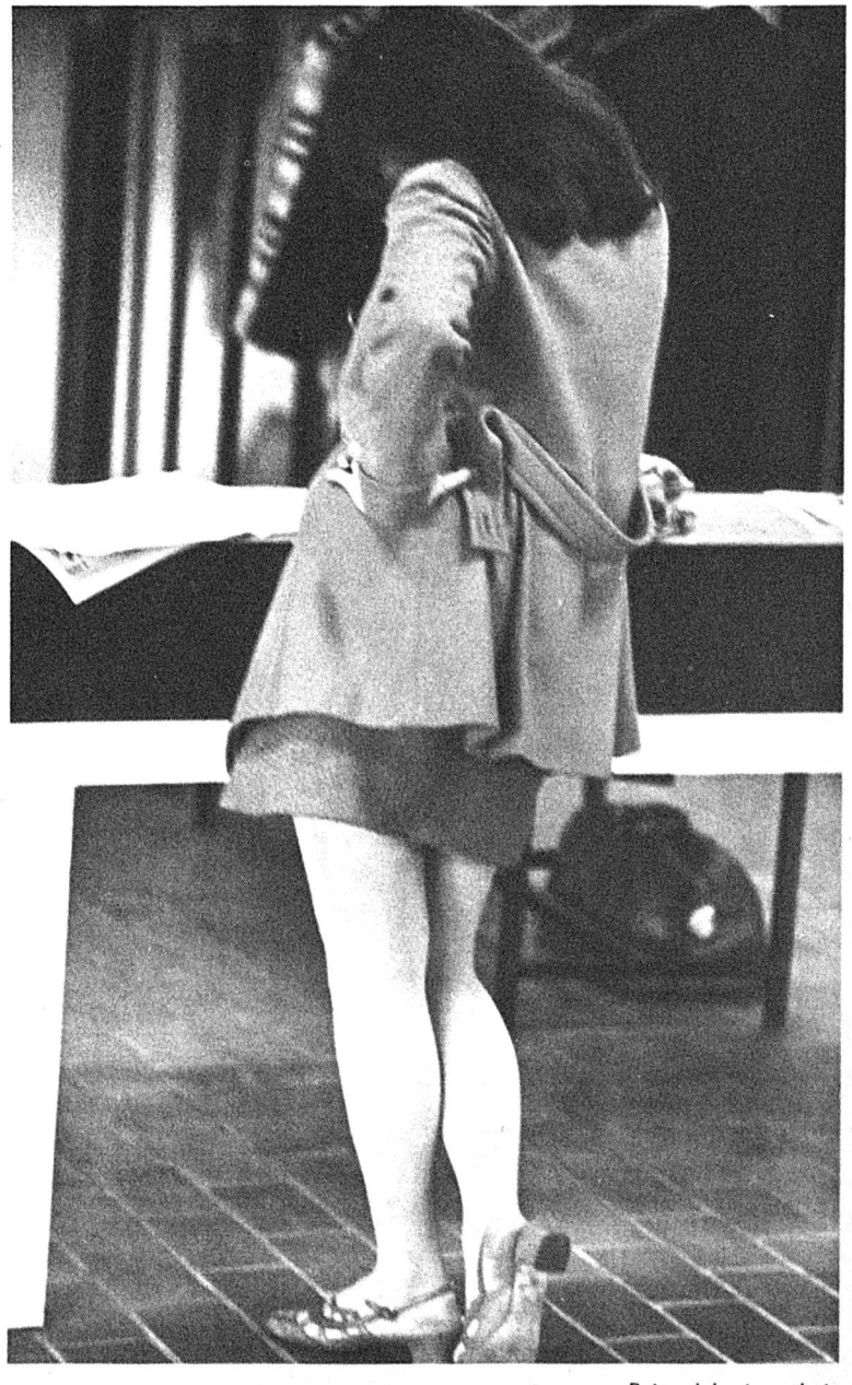
THE MINI SEEN FROM BEHIND