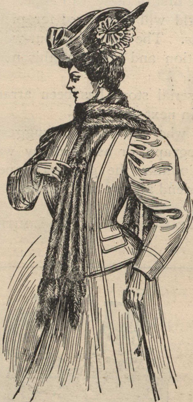
G3-806—Natural Labrador Mink Throw Scarf—Made from six whole skins with double ends, solid, $37.50 for.....

THESE are first quality and perfect in every respect, and they look the part. But see the prices! You can save money buying furs at this store. If you cannot come to Toronto conveniently, order by mail. It is just as safe, just as cheap and it's even less trouble than ordering right here in the store, and furthermore, you have the advantage at this store of returning any purchase that is not entirely satisfactory to you and your money will be refunded.