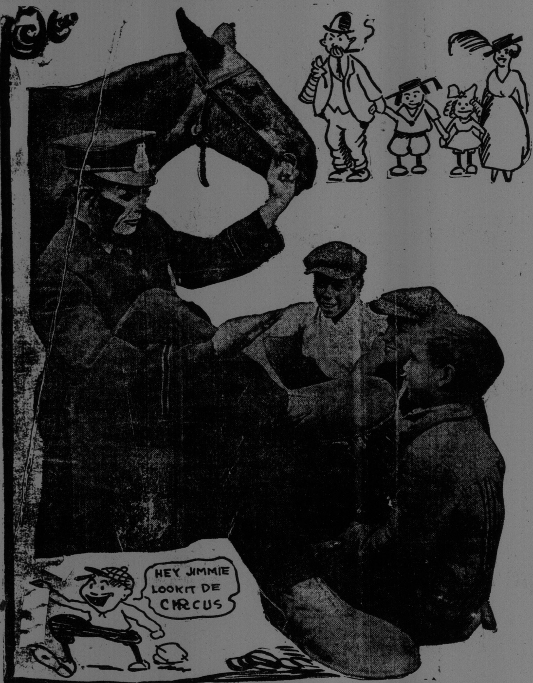
8, 11 Hello Skinny—Sells' Floto Circus is coming to St. John Monday next, June 20. Let's go!