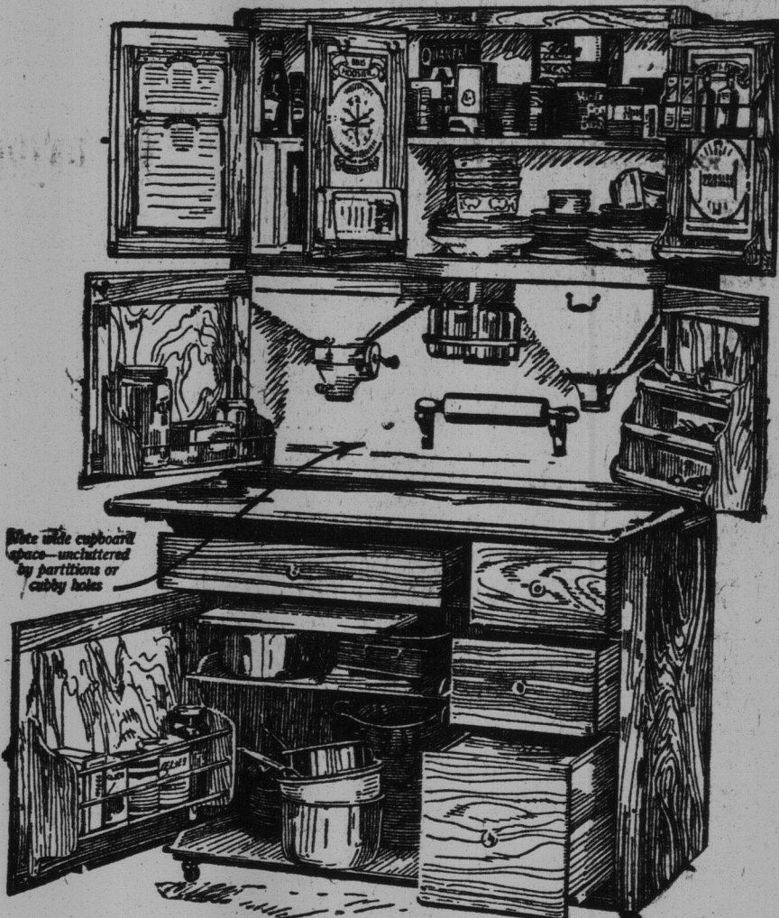
This is "HOOSIER BEAUTY" The National Step Saver

Hoosiers Delivered to your Home for $1.00