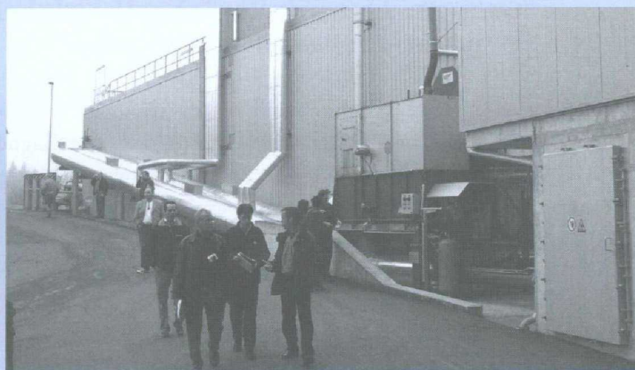
The Canadian delegation visited biogas plants in southern Germany and Austria.

In fact, this is one of the most effective methods of converting biomass to energy. The methane in biogas can be used to either fuel electrical generators or, with suitable