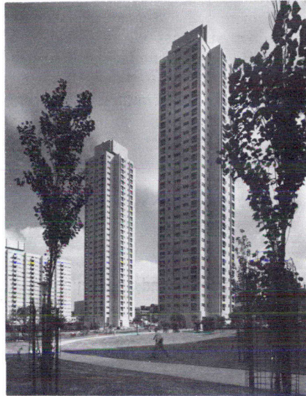
Four public rooms named Quebec, St. Lawrence, Newfoundland and Vancouver, represent Canada in this new Australian housing project for the elderly built by the New South Wales Housing at Waterloo, Sydney.

One of the towers has been named "Matavai", after the Tahitian harbour