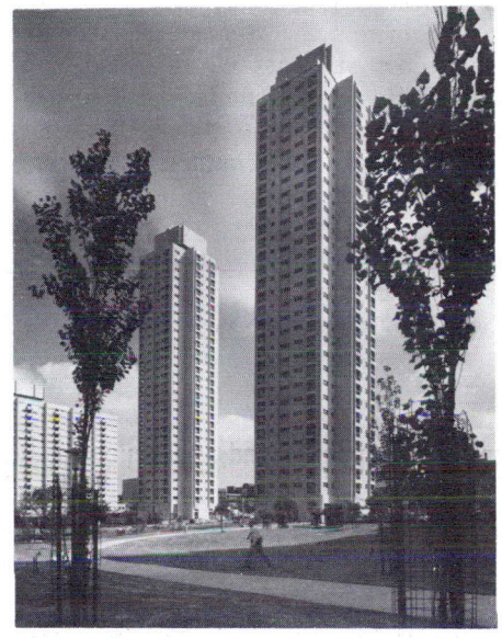
Four public rooms named Quebec, St. Lawrence, Newfoundland and Vancouver, represent Canada in this new Australian housing project for the elderly built by the New South Wales Housing at Waterloo, Sydney.

One of the towers has been named "Matavai", after the Tahitian harbour