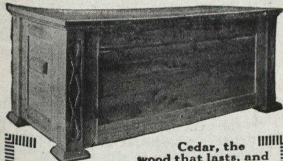
Cedar, the wood that lasts, and lasts, and lasts.

OUR CEDAR CHESTS furnish a permanent and handsome utility for the home, made to provide storage for furs and woolen clothing and to protect them against moths and dampness. Why buy valuable furs and clothing, now more costly than ever before, without providing protection for them?