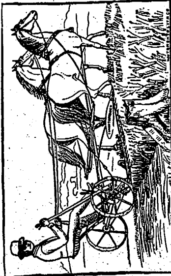
OVER A STUMP—KNIFE IN FULL MOTION.

For steady, even, clean and powerful cutting no mowing machine has ever been designed that can equal the MASSEY-TORONTO Mower. It is made exceptionally strong, and for rough land its rival is not known. It is often used on new land, where it would be most unsafe to venture with any other style of machine. It can even be used for underbrushing a swamp. The MASSEY-TORONTO Mower is the only machine which practically admits of the cutter bar being raised to an upright position with the knife in full motion. No stopping required with the "Toronto" in passing obstacles.