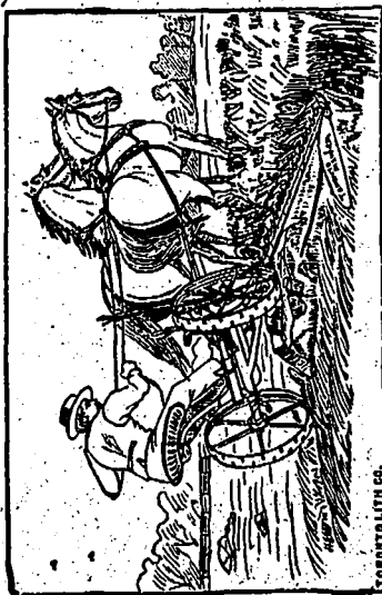
OVER A STONE—KNIFE IN FULL MOTION.