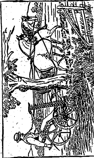
PASSING A TREE—KNIFE IN FULL MOTION.

road for miles without the slightest danger of injury to the machine, as when out of gear the only two cog wheels on it are thrown wide apart and the machine is like a sulky, and with the fine spring seat rides almost as easy. The Guards are of tested malleable iron, fitted with ledger plates of steel made at our own works. The Sections are made of best English steel, specially imported by ourselves for this purpose. These, as well as the Ledger Plates, are made by ourselves. Our new Knife and Bar Department is thoroughly equipped and constitutes a large industry in itself. The Cutter Bar is of steel, and is thoroughly tested before being fitted with guards and knives. A lead wheel in the inside cutter bar over inequalities of the land.