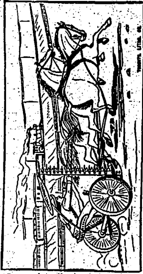
LET HER GO! NO HARM CAN COME.

30,692 Massey-Toronto Mowers have already been sold and are in actual use, many of them having cut 13 seasons.