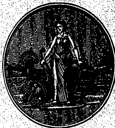
Fac-simile of the SILVER MEDAL , the Highest Award of merit given

In Europe it won three medals and other prizes last harvest, while at the great international field trial (the greatest ever held) which recently took place in connection with the World's Fair at Paris, where fifteen machines competed in a four days' contest, the work done by the "Toronto" was so much faster, better, and so much more simply and easily done that the crowds present, and even competitors, acknowledged its great superiority. While the decision of the twenty-eight jurors has not as yet been published, it has been semi-officially announced by the press that the Toronto Light Binder has taken the highest award.