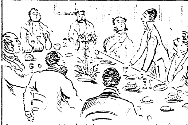
To take away of the best he proposes a comic song.