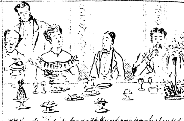
With a gasp that she is foggy with the red wine is my husband's.