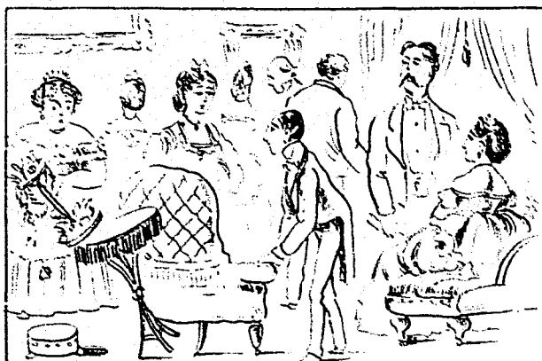
The very uncomfortable 5 minutes before dinner.