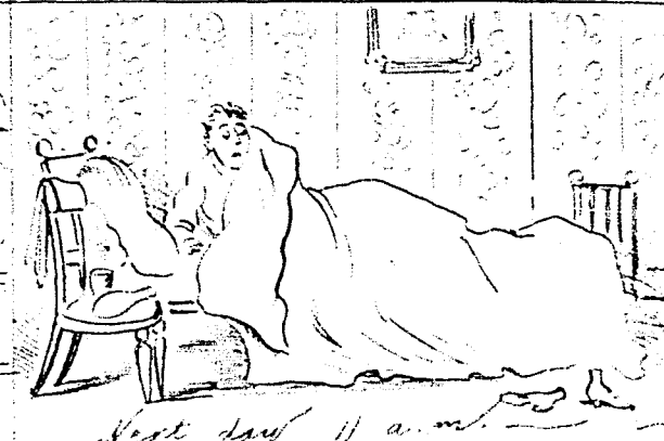
Next day 11 a.m.