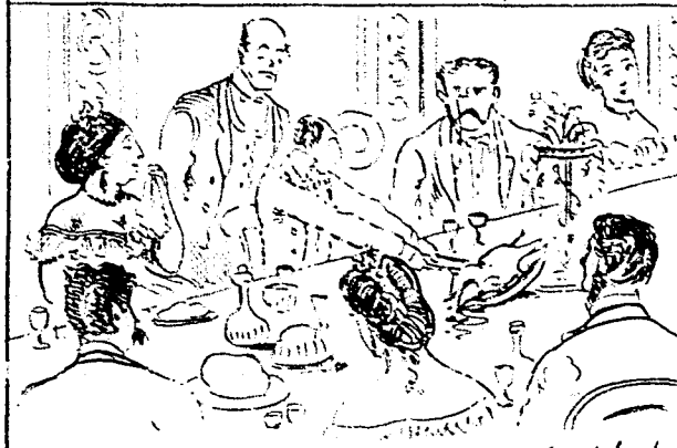
It unexpectedly finds he has to carry a pair of hickies.