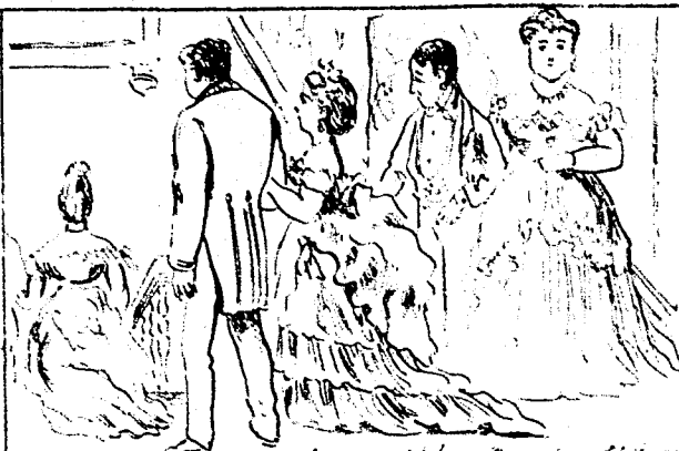
Of course he has not the pleasure of taking this down to dinner.