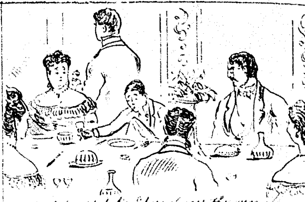
Upon seeing some of his 'cherry' goes the wrong way.