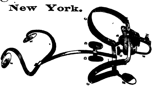
Fig. No. 19.

How to measure for any of these appliances.