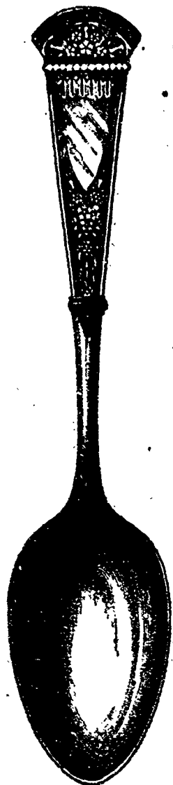
THE IMPERIAL PATTERN.