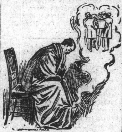
IT WAS A COUGH THAT CARRIED HIM OFF. IT WAS A COUGH THEY CARRIED HIM OFF BY.

"Why should I try to cheat my appointed hours?" he cries.