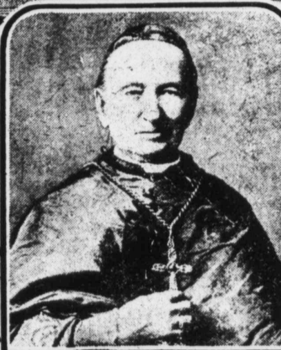
His Eminence Cardinal Begin who will head the Canadian Pilgrimage to Rome, leaving Montreal and Quebec on May 5 next on board the Minnedosa.

The opening rites of Holy Year have already been performed and the Papal Bull, formally announcing its commencement and inviting Catholics the World over to assemble in Rome has been issued. The purposes of the Great Jubilee as set forth in the Papal Bull are to live to achieve men in divine charity. The opportunities to preside Pentecostal ceremonies afforded them by His Pious XI, are powerful factors in many to visit the Holy City. The Minnedosa sails from Montreal and