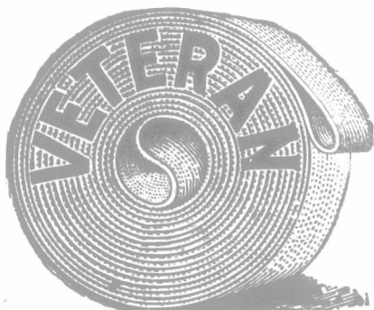
The Belt with a Service Record