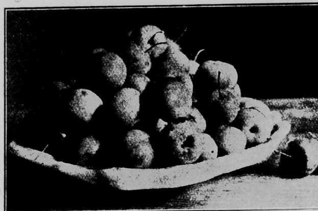
Plate of Crab Apples Grown in the Patmore Nursery, Brandon.

We offer for a Bare Prairie Farm a FIVE DOLLAR SHELTER COLLECTION comprising: 50 WILLOWS, 50 MAPLES, 25 POPLAR, 25 ASH all 2 ft. to 3 ft. high