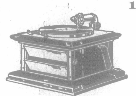
THE CLIMAX, $25.00 These Double-Diec Pec