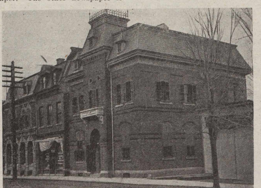
Custom House, St. John's, P. Q.

Mention has been made of the diversity of the Industries that, to the great good of the place, are carried on at St. John's. Their varied (Continued on Page 17).