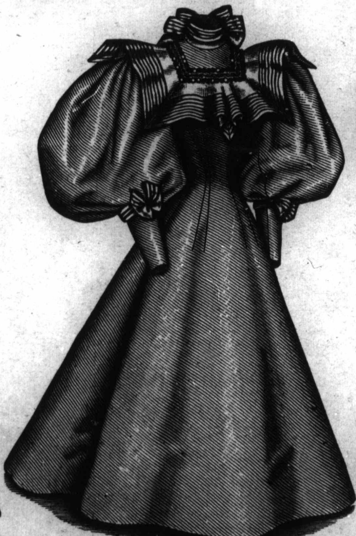
8171 LADIES' COSTUME, WITH SEVEN-GORED SKIRT ARRANGED IN FOUR SIDE-PLAITS AT THE BACK. (COPYRIGHT.) No. 8171.—This pattern is in 13 sizes for ladies from 28 to 46 inches, bust measure. For a lady of medium size, it requires 8\frac{1}{2} yards of dress goods 40 inches wide, with \frac{3}{4} yard of Persian velvet 20 inches wide. Of one material, it needs 14\frac{1}{2} yards 22 inches wide, or 10\frac{1}{2} yards 30 inches wide, or 9\frac{1}{2} yards 36 inches wide, or 7\frac{1}{2} yards 44 inches wide. Price of pattern, 40 cents.