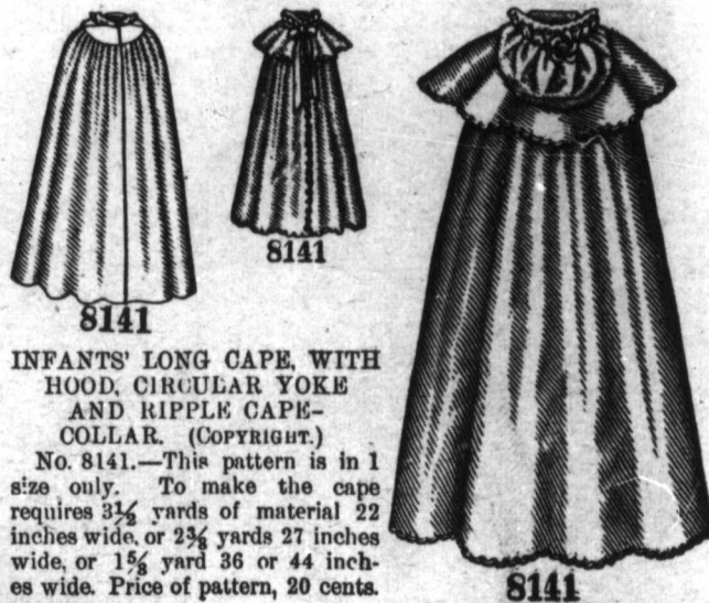
8141 8141 INFANTS' LONG CAPE, WITH HOOD, CIRCULAR YOKE AND RIPPLE CAPICOLLAR. (COPYRIGHT.) No. 8141.—This pattern is in 1 size only. To make the cape requires 3\frac{1}{2} yards of material 22 inches wide, or 2\frac{3}{4} yards 27 inches wide, or 1\frac{1}{2} yard 36 or 44 inches wide. Price of pattern, 20 cents.