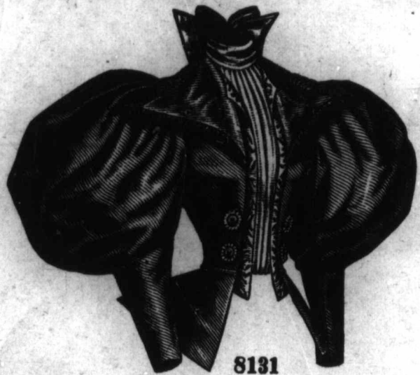
8131 LADIES' BASQUE, WITH RIPPLE PEPLUM SEWED ON. (KNOWN AS THE LOUIS XV. COAT.) (COPYRIGHT.) No. 8131.—This pattern is in 13 sizes for ladies from 28 to 46 inches, bust measure. For a lady of medium size, it needs 6 yards of plain and \frac{1}{2} yard of brocaded satin each 20 inches wide, with \frac{1}{2} yard of chiffon 45 inches wide. Of one material, it requires 6\frac{1}{2} yards 22 inches wide, or 4\frac{1}{2} yards 30 inches wide, or 4 yards 36 inches wide, or 3\frac{1}{2} yards 44 inches wide. Price of pattern, 30 cts.