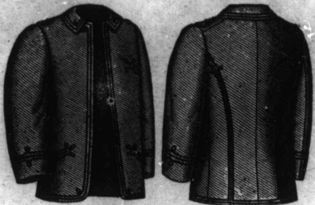
8125 8125 MEN'S LOUNGING OR HOUSE JACKET. No. 8125.—This pattern is in 10 sizes for men from 32 to 50 inches, breast measure. To make the jacket for a man of medium size, will require 2\frac{1}{2} yards of material 27 inches wide, or 1\frac{1}{2} yard of goods 54 inches wide. Price of pattern, 30 cents.