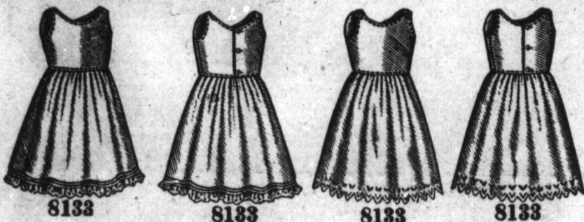
8133 8133 8133 8133 SET OF BABY'S FIRST SHORT CLOTHES, COMPRISING A DRESS, CAMBRIC SKIRT AND FLANNEL SKIRT. (COPYR'T.) No. 8133.—This pattern is in 1 size— \frac{1}{2} year. The dress calls for 1\frac{1}{2} yard of nainsook 36 inches wide, with 1\frac{1}{4} yard of embroidered edging 3 inches wide. Of one material, it needs 2 yards 36 inches wide. The cambric skirt calls for 1\frac{1}{2} yard of goods 36 inches wide. The flannel skirt needs \frac{1}{2} yard of flannel either 27 or 36 inches wide, with \frac{1}{2} yard of muslin 36 inches wide. Price of pattern, 30 cts.