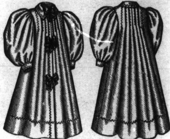
8161 8161 LITTLE GIRLS' WRAPPER. (COPYRIGHT.) No. 8161.—This pattern is in 9 sizes for little girls from \frac{1}{2} to 8 years old. For a girl of 5 years, it needs 5 yards of material 22 inches wide, or 3\frac{1}{2} yards 27 inches wide, or 3\frac{1}{2} yards 36 inches wide, or 3 yards 44 inches wide. Price of pattern, 20 cents.