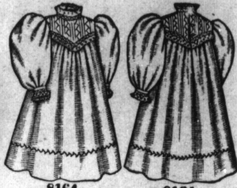
8164 8164 CHILD'S DRESS, HAVING A POINTED YOKE AND A SKIRT WITH STRAIGHT LOWER EDGE FOR HEMSTITCHING. (COPYRIGHT.) No. 8164.—The pattern of this dainty little dress is in 7 sizes for children from \frac{1}{2} to 6 years of age. For a child of 4 years, it needs 2\frac{1}{2} yards of lawn 36 inches wide, with \frac{1}{4} yard of fancy tucking 27 inches wide. Of one material, it needs 4\frac{1}{2} yards 22 inches wide. Price of pattern, 20 cts.