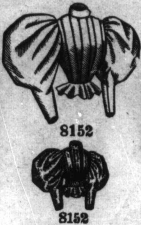
8152 8152 LADIES' BASQUE, WITH PLAITS LAID ON AND RIPPLE PEPLUM. (KNOWN AS THE NORFOLK BASQUE.) (COPYRIGHT.) No. 8152.—This pattern is in 13 sizes for ladies from 28 to 46 inches, bust measure. To make the basque for a lady of medium size, will require 6\frac{1}{2} yards of goods 22 inches wide, or 4 yards 36 inches wide, or 3\frac{1}{2} yards 44 inches wide, or 3 yards 50 inches wide. Price of pattern, 30 cts.