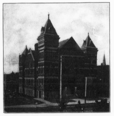
NEW METHODIST CHURCH, PETROLEA, ONT.

Huron County has solved the Convention problem. For four years they have met together as a United Sunday School and Christian Endeavor Convention with splendid results. This year they met in Seaforth on June 19th and 20th. Every Young People's Society is enlisted as well as every Sunday School (except the Episcopalians) which makes a very strong combination. The