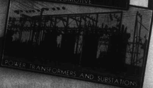
POWER TRANSFORMERS AND SUBSTATIONS