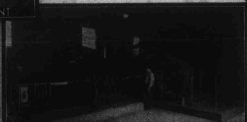
HOIST MOTORS AND CONTROL