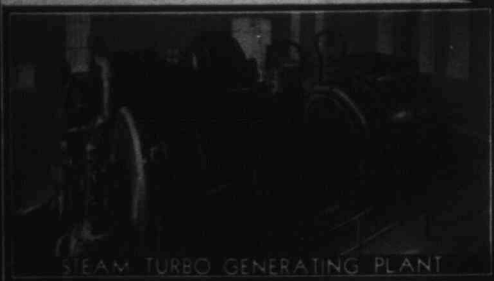
STEAM TURBINE GENERATING PLANT