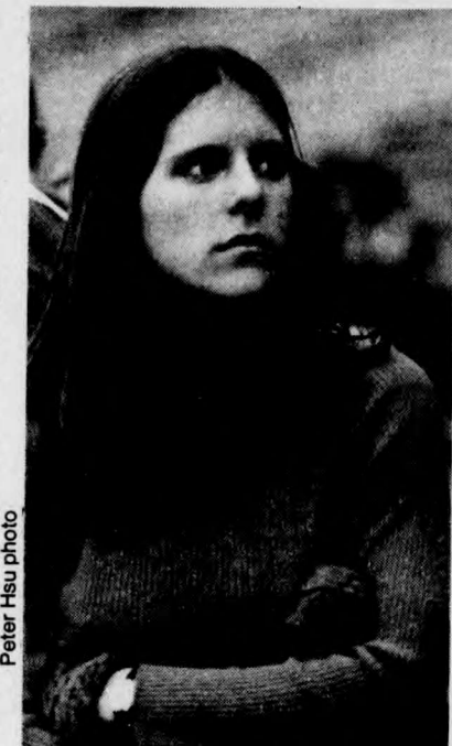
York Student, caught pondering role of universities.

ONE FLIGHT HIGH 46 BLOOR WEST TORONTO, CANADA 921-6555