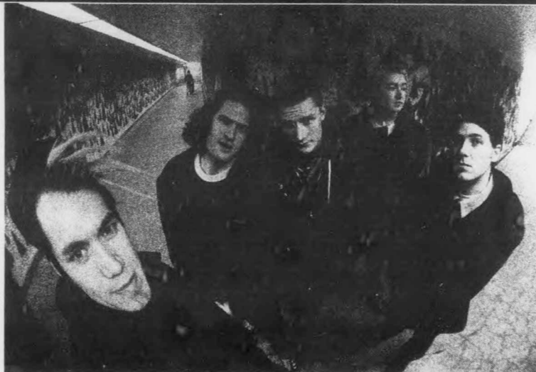
The wacky guys from SNFU. Coming to a town near you soon